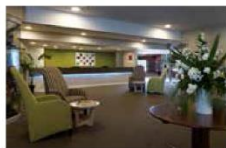
ROTORUA Sudima Hotel Lake Rotorua