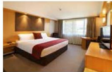
ROTORUA - Millennium Hotel & Resort Taupo Manuels