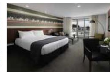
CHRISTCHURCH Rydges Latimer Christchurch