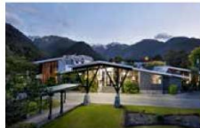
GLACIER REGION Scenic Hotel Franz Josef Glacier