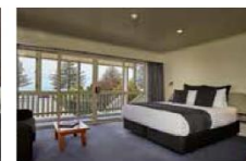
KAIKOURA The White Morph