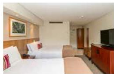
AUCKLAND Copthorne Hotel Auckland City