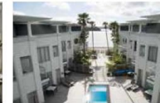
BAY OF ISLANDS The Waterfront Suites