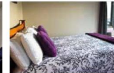
GREYMOUTH Breakers Boutique Accommodation