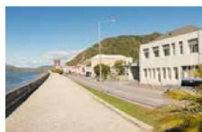
GREYMOUTH Kingsgate Hotel Greymouth