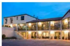
KAIKOURA Lobster Inn Motor Lodge