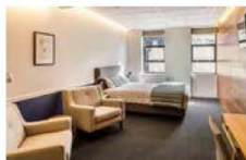
WELLINGTON Park Hotel Lambton Quay