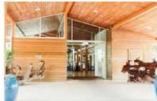
BAY OF ISLANDS Copthorne Hotel & Resort Bay of Islands