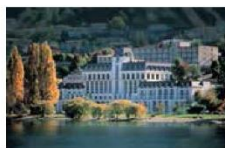
QUEENSTOWN Rydges Lakeland Resort