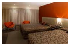
DUNEDIN Kingsgate Hotel Dunedin