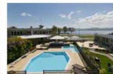
TAUPO Anchorage Resort