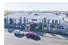
CHRISTCHURCH Pavilions Hotel Christchurch