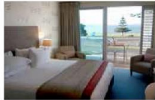
NAPIER The Crown Hotel