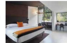
QUEENSTOWN Queenstown Park Boutique Hotel