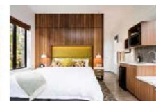
GLACIER REGION Rainforest Retreat