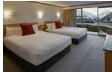
MT COOK The Hermitage Hotel