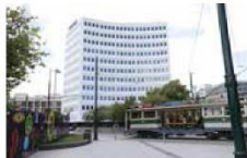
CHRISTCHURCH Distinction Christchurch