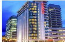
WELLINGTON Rydges Wellington