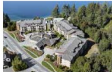
QUEENSTOWN Heritage Queenstown