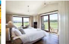
WANAKA Wanaka Haven