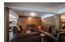
GREYMOUTH The Ashley Hotel