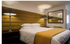
GREYMOUTH The Ashley Hotel Greymouth