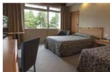
ROTORUA Copthorne Hotel Rotorua