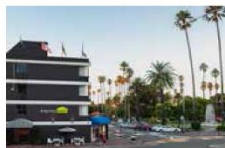
NAPIER Expresso Hotel