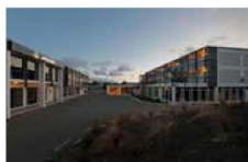
CHRISTCHURCH The Ashley Hotel