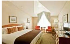
QUEENSTOWN Millennium Queenstown