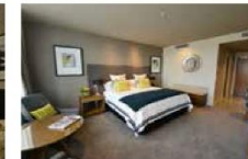
DUNEDIN Distinction Dunedin