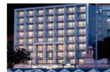
WELLINGTON Copthorne Hotel Oriental Bay