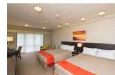
BAY OF ISLANDS Scenic Hotel Bay of Islands