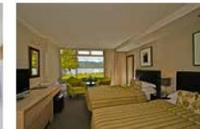
TE ANAU Distinction Te Anau Hotel & Villas