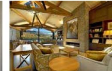
QUEENSTOWN - The Rees Hotel, Luxury Apartments & Lakeside Residences