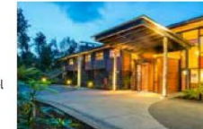
GLACIER REGION Te Waonui Forest Retreat