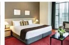
AUCKLAND Heritage Auckland