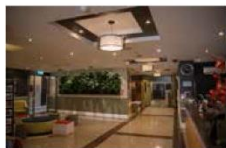
AUCKLAND Auckland City Hotel