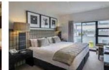
CHRISTCHURCH The George Hotel