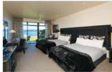
TAUPO Millennium Taupo