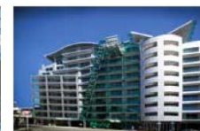
WELLINGTON Distinction Wellington