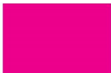
WANAKA Wanaka Hotel