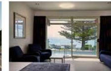
KAIKOURA The White Morph