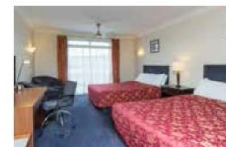
ROTORUA Distinction Rotorua