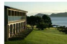
BAY OF ISLANDS Copthorne Hotel & Resort Bay of Islands