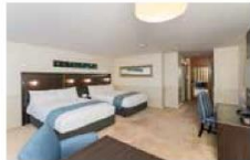
DUNEDIN Scenic Hotel Southern Cross