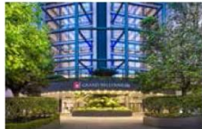
AUCKLAND Grand Millennium