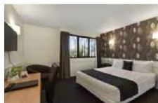
CHRISTCHURCH Quality Hotels Elms