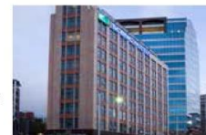
AUCKLAND Scenic Hotel Auckland