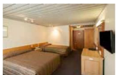
TE ANAU Kingsgate Hotel Te Anau