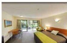
GLACIER REGION Studio Room