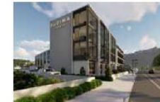
KAIKOURA Sudima Kaikoura