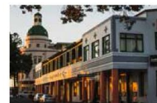
NAPIER Art Deco Masonic Hotel