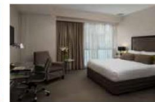
AUCKLAND Rydges Auckland