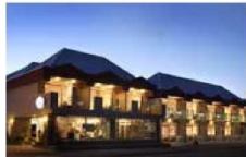
KAIKOURA The White Morph