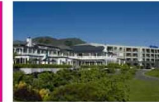
TAUPO Hilton Lake Taupo