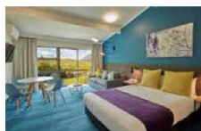
MT COOK Mt Cook Lodge & Motels