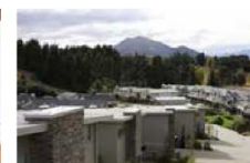
WANAKA Distinction Wanaka