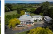
NAPIER Mangapapa Hotel