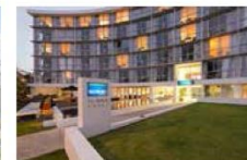
NAPIER Scenic Hotel Te Pania