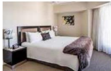
WELLINGTON The Crown Hotel