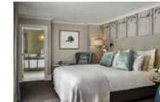
AUCKLAND - Hotel Grand Windsor MGallery by Sofitel