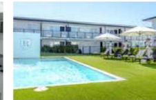
ROTORUA Regent of Rotorua Boutique Hotel