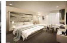
CHRISTCHURCH Sudima Christchurch City