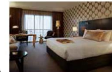
WELLINGTON QT Wellington