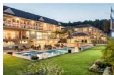
BAY OF ISLANDS Kingsgate Hotel Autolodge